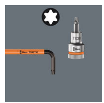
Take it easy tool finder system with profile and size colour-coding for quick and easy tool selection. Colour-coded system for hexagon drive screws (L-Keys, Zyklop bit sockets), external hex drive screws and nuts (Joker wrenches, Zyklop sockets and Zyklop bit sockets with holding function), and TORX® drive screws (L-Keys, Zyklop bit sockets).