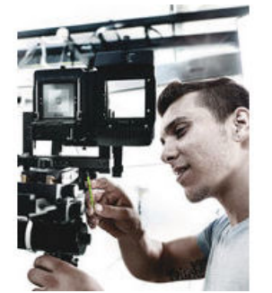
Holding function for recessed TORX® screws